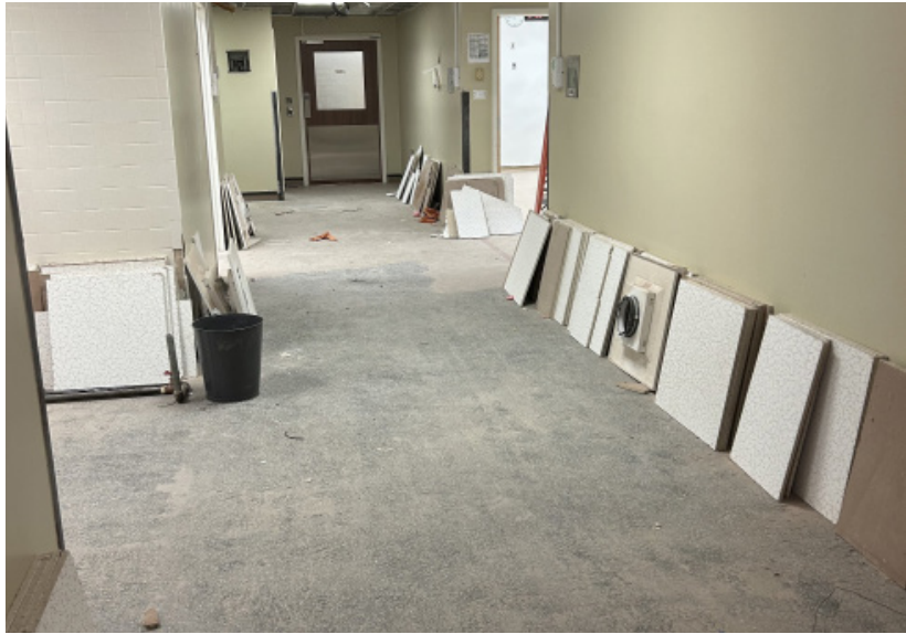
Renovations for PACU