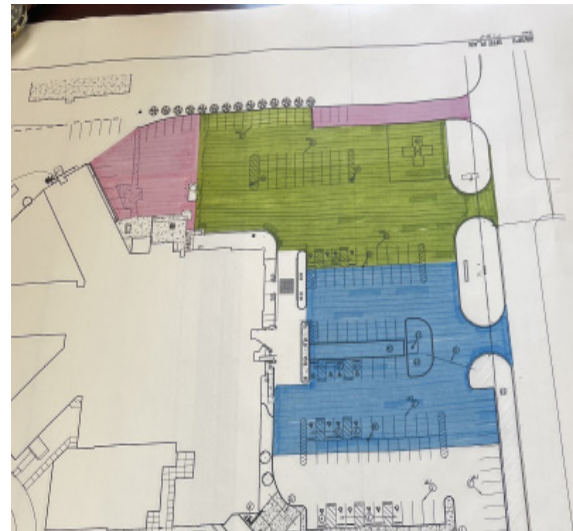
Phases of Parking Lot Construction