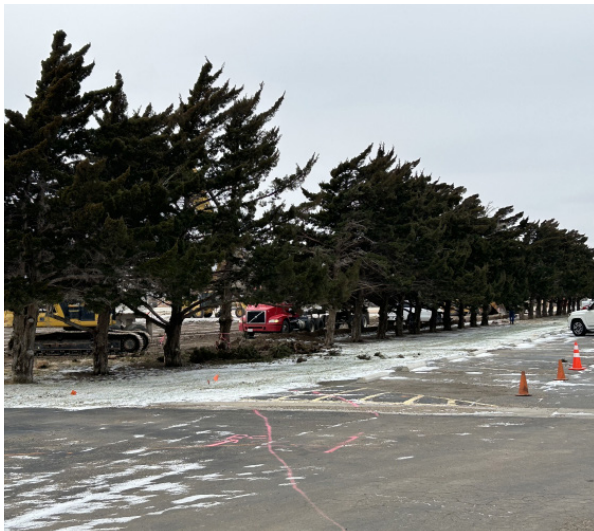
Phase 1 Parking Lot Construction

The recent completion of OGH's Surgical Center kickstarts several exciting construction projects within the District. The most noticeable change for the public will be the construction of new parking areas on the south side of the hospital. Just south of the tree row, a new parking lot intended for employee parking has begun. The parking area will be in three phases; phase one (pink) will include the parking area for the doctors, and a portion of the general employee parking; phase two (green) includes moving the helipad and a second section for employees and patient parking. The final phase (blue) will be the area where patients park in front of the hospital. Inside the hospital, the previous surgery area is being converted into a recovery room or PACU (Post Anesthesia Care Unit). The laboratory services at OGH have outgrown their current area and are now expanding down the hall combining the old staff areas for surgery and the ultrasound rooms. We are so excited to grow our hospital and clinic!