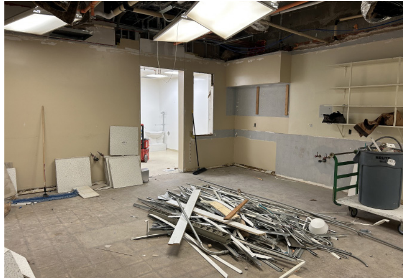
Renovations for Laboratory