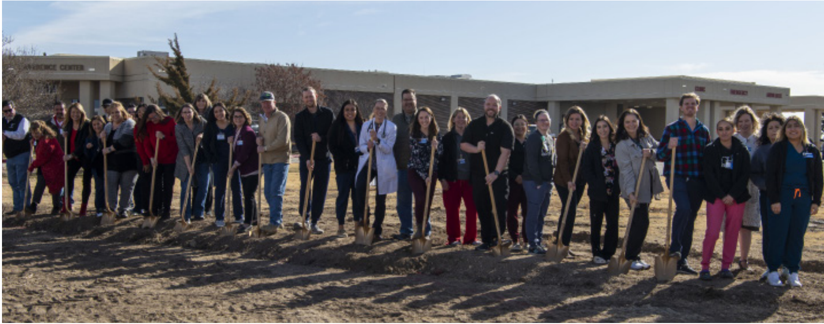
Hospital Administration, OGH Board Members, Providers and Staff join for a ground breaking to begin construction on Perryton Health Center.

The recent completion of OGH's Surgical Center kickstarts several exciting construction projects within the District. The most noticeable change for the public will be the construction of new parking areas on the south side of the hospital. Just south of the tree row, a new parking lot intended for employee parking has begun. The parking area will be in three phases; phase one (pink) will include the parking area for the doctors, and a portion of the general employee parking; phase two (green) includes moving the helipad and a second section for employees and patient parking. The final phase (blue) will be the area where patients park in front of the hospital. Inside the hospital, the previous surgery area is being converted into a recovery room or PACU (Post Anesthesia Care Unit). The laboratory services at OGH have outgrown their current area and are now expanding down the hall combining the old staff areas for surgery and the ultrasound rooms. We are so excited to grow our hospital and clinic!