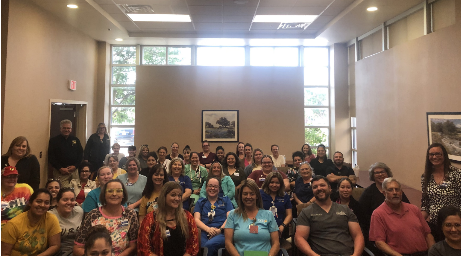
OGH Staff after debriefing meeting (not all staff pictured)

T hank you to all of the employees who were able to help during the tornado. We were able to treat approximately 160 patients who were injured during the tornado on June 15, 2023. Once patients started coming in, a text was sent to all employees asking for assistance to help. An overwhelming response of staff came to assist. With every employee, volunteer, and support from surrounding communities, we could treat this many patients effectively. I cannot express how much this means to me to work with such a great team. Perryton is a supportive community with incredible people who would do anything for each other.