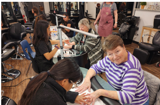
Pampering at FPC Cosmetology