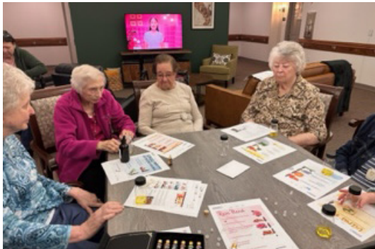
Perfume Making Class