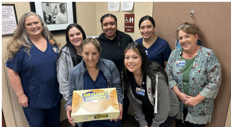
PHC Staff - Donuts from FBSW