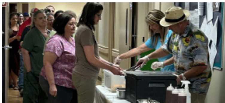
Hospital District Staff - Security Insurance Lunch