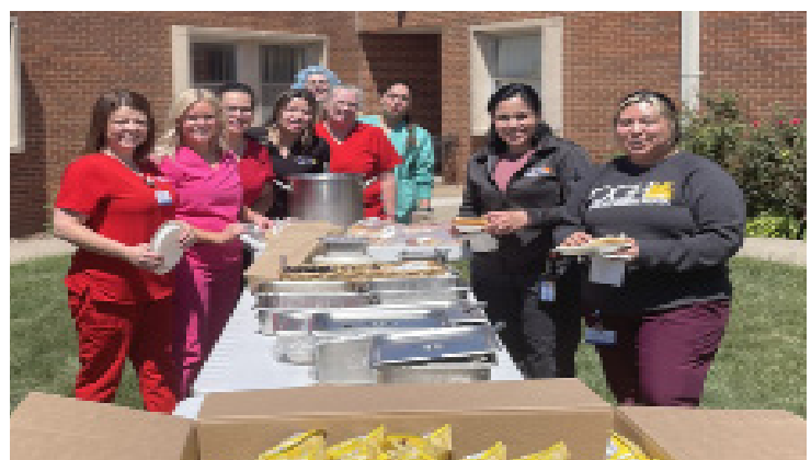
Hospital District Staff- Perryton Insurance Lunch